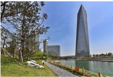
40% of Songdo IBD is open space