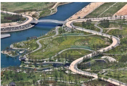
Central Park, Songdo IBD (100 acres)

Gale International considers how each development will enhance and protect the overall health, natural environment and quality of life of the community, both in and around the development. The company has adopted the Leadership in Energy and Environmental Design (LEED) Green Building Rating System and is targeting LEED certification for all active development projects.