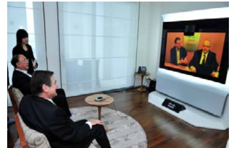
China-Korea TelePresence, Shanghai Expo

In China, Gale International and Cisco are pursuing projects that use Songdo IBD as a model for economically viable and environmentally responsible development. This unique collaboration will significantly accelerate the development of smart and sustainable cities worldwide.