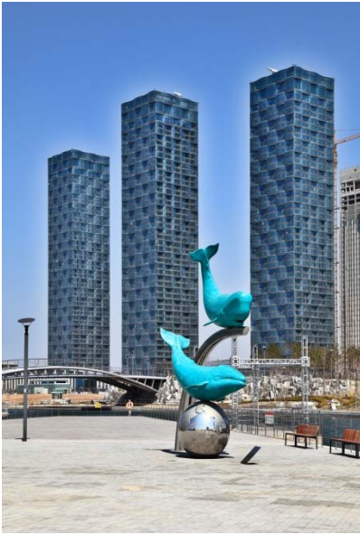
the # Central Park Towers, Songdo IBD Korea

Gale International is a premier, global real estate development and investment company dedicated to creating dynamic urban environments in which people live, work and thrive. Headquartered in New York City with offices across North America and Asia, the company has decades of experience leading commercial, residential and mixed-use projects, from landmark towers to smart, sustainable city-scale developments.