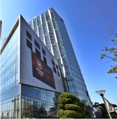
Sheraton Incheon, Songdo IBD Awarded LEED Silver Certification