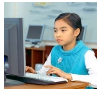
Chadwick International School Songdo IBD, Korea