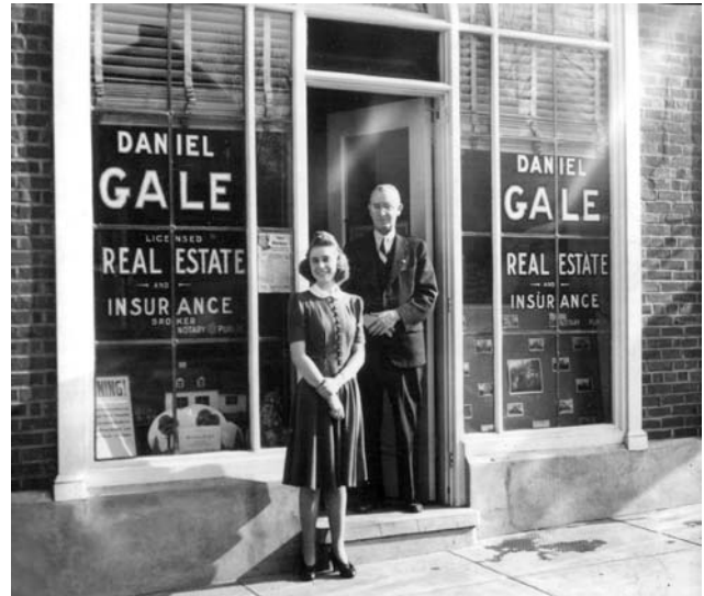
Daniel Gale Agency, Huntington, NY USA